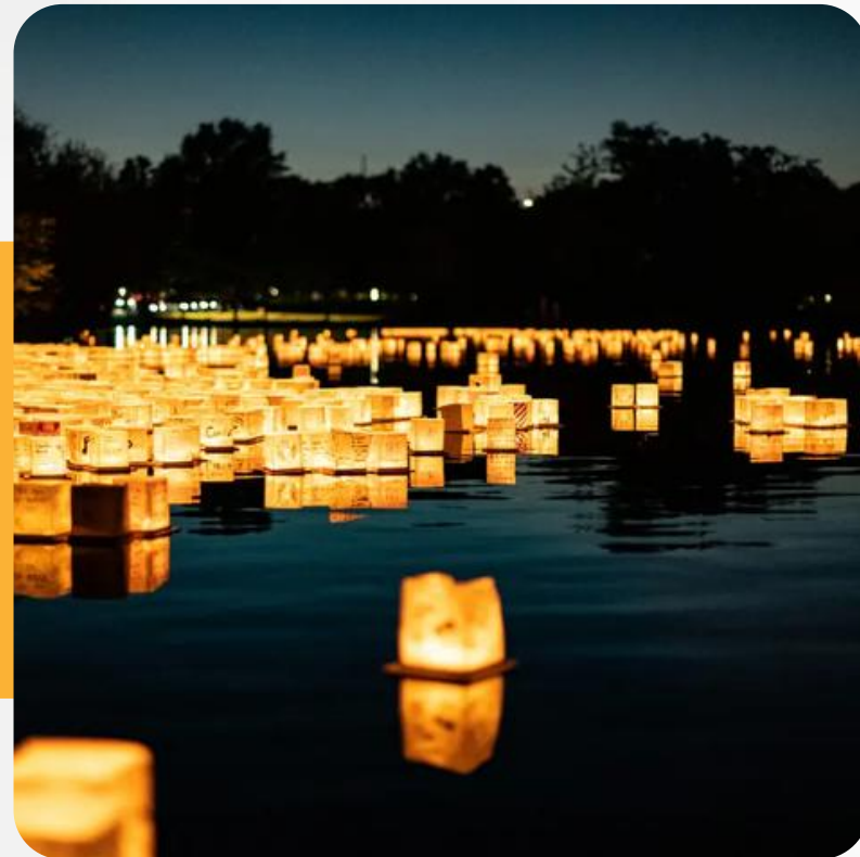
Water Lantern Festival 1 Day 11.8k Visits