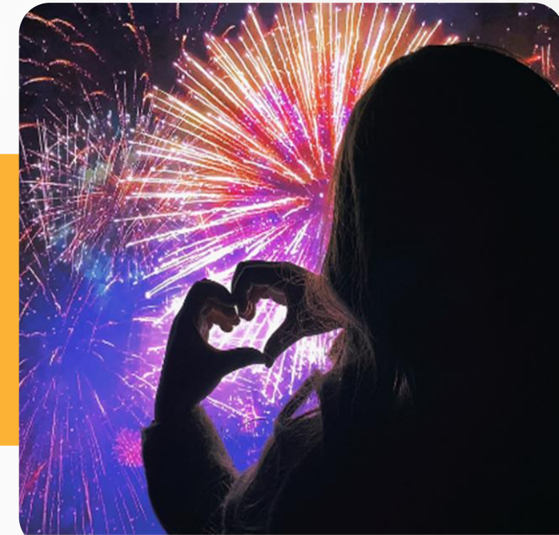
River of Fire 1 Day 23k Visits

River of Fire is the largest Single day event in the Tri-Cities