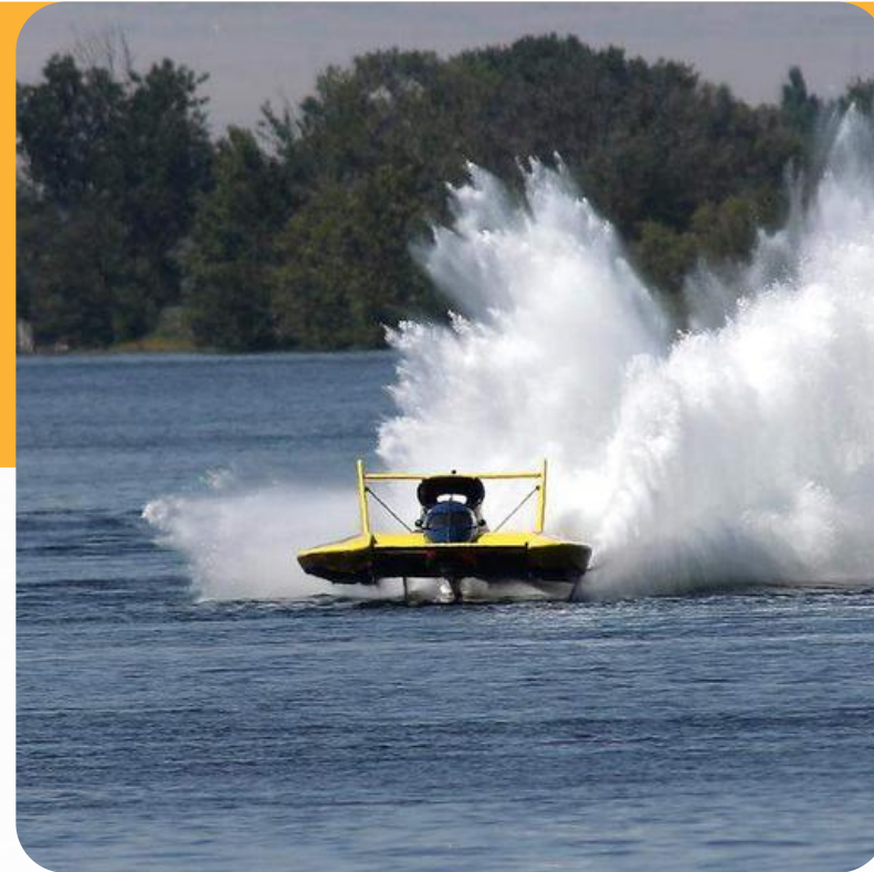
Water Follies 3 Day 50.8k Visits